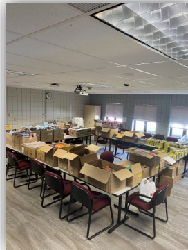
The assembly line for bag creation