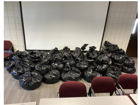
25 Meijer bags per black bag. This is a 1/4 of the bags that we started with